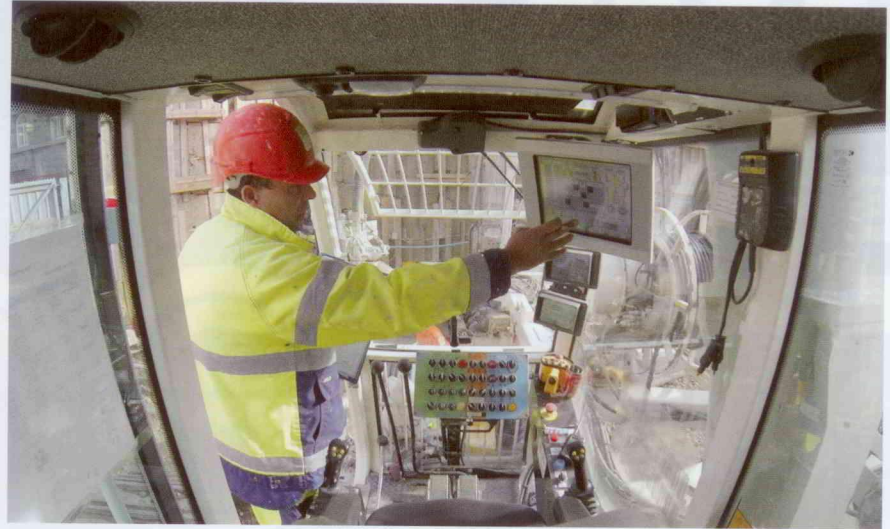
A Trevi worker uses Soilmec's Drilling Mate System to monitor the hydromill diaphragm wall construction in Copenhagen.