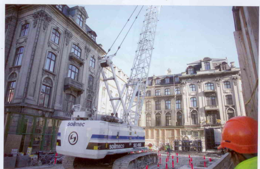
Trevi workers construct cased auger piles near the Marmorkirken (Marble Church). Monitoring with Soilmec's Drilling Mate System helped ensure that this historic church was left undisturbed.

Monitoring maintenance issues using the DMS has been essential in Copenhagen, where the layers of hard boulders and flint rock have caused daily breakage of the cased secant piling tooling. The DMS has allowed Trevi main-