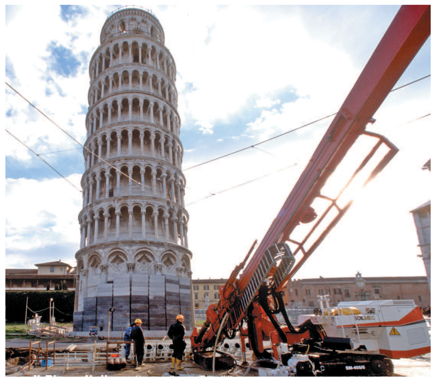
The temporary post-tension concrete ring with lead blocks stacked on the north side of the Tower foundation. The backstay cables are also visible.

foundation that had begun in 2000. In preparation, 120 sensors were placed in, around, and outside the Tower. Telecoordinometers, GB pendulum, level meters, and inclinometers were placed on the central rotation axes of the Tower. Weather stations, thermometers, strain gauges, and external and internal stairwell deformometers were placed on the Tower perimeter.