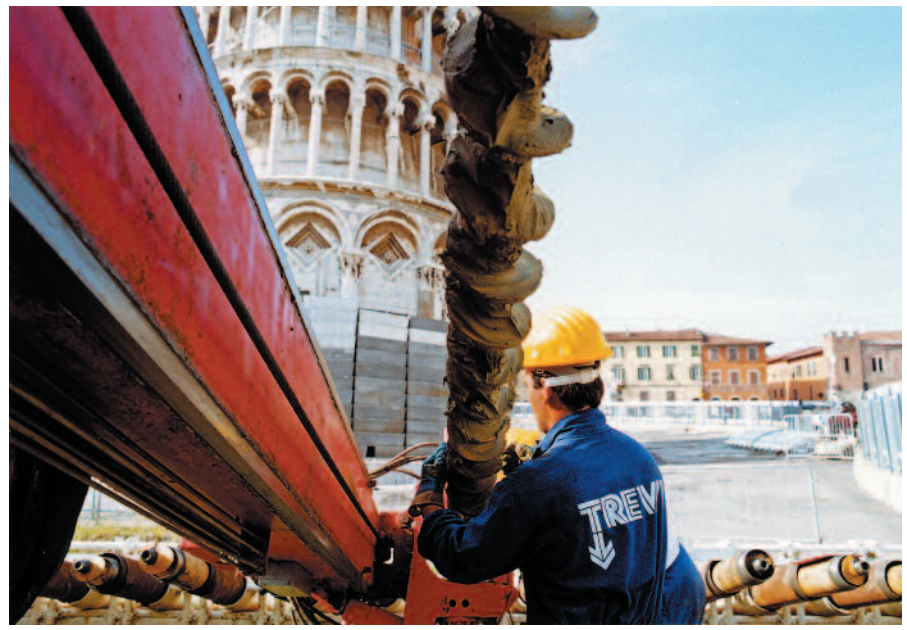
Soil excavation from under the Tower during the final geotechnical stabilisation.

soil extraction was selected, using soil extraction tubes installed adjacent to, and only beneath the north side of the foundation. This plan was arrived at by the application of physical models and advanced numerical analysis. The team determined that the soil extraction had to take place north of a critical line located about half a radius from the northern edge of the foundation. This was undertaken to maintain Tower stability.