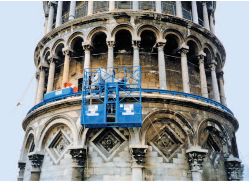
Steel cables sheathed in Teflon being positioned and tensioned around the first story cornice with a specially-designed device.

tons. A special device was developed to position and tension these wires.