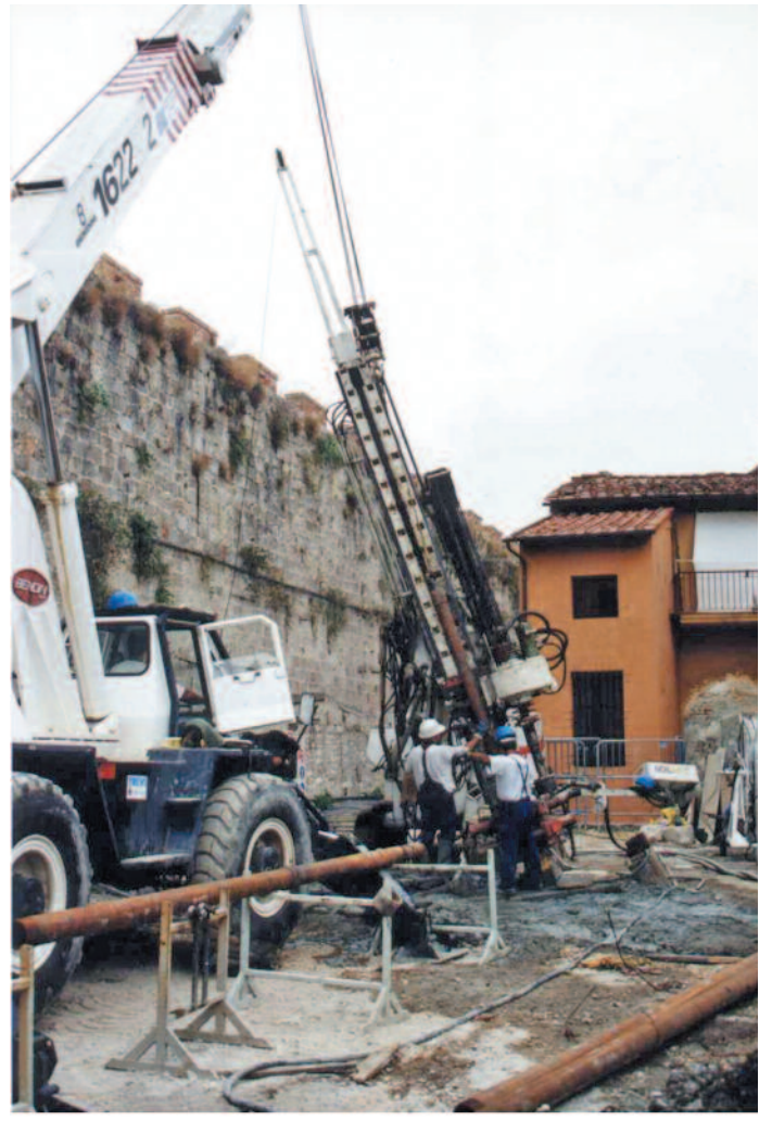
Temporary rigging trestle used to attach a backstay to the Tower, to prevent potential movement of the Tower during restoration operations.

In 1992 critical areas of the Tower were "hooped" with steel cables sheathed in Teflon and slightly pre-tensioned. These temporary strands were removed near the end of 2000 and replaced with more aesthetic, permanent circumferential wires using 4 mm stainless steel strands. The permanent hoop below the first story cornice is made up of 116 coils in four layers with an applied tensile force of 9 tons. The hoop at the base of the second story is comprised of 60 coils in three layers with an applied tensile force of 4.6