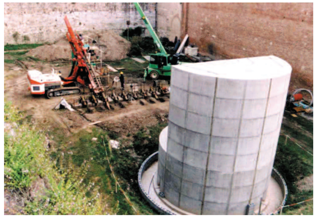
Large-scale field test performed in the Piaaza.

Trevi began limited excavation work under the actual Tower in