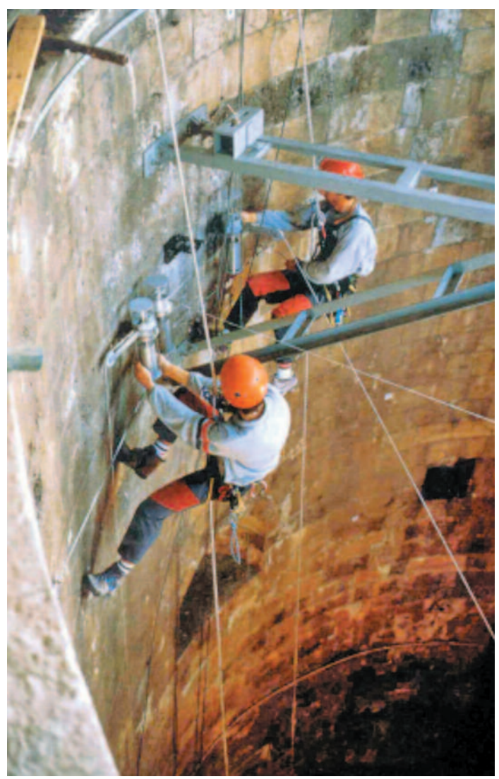
Installation of complex monitoring equipment to allow continuous measurement of the Tower's displacements, rotations, stresses, temperatures and vibrations.

Tower to lean further south. Once this was discovered, a custom drainage system was installed to normalize the water table below the Tower.